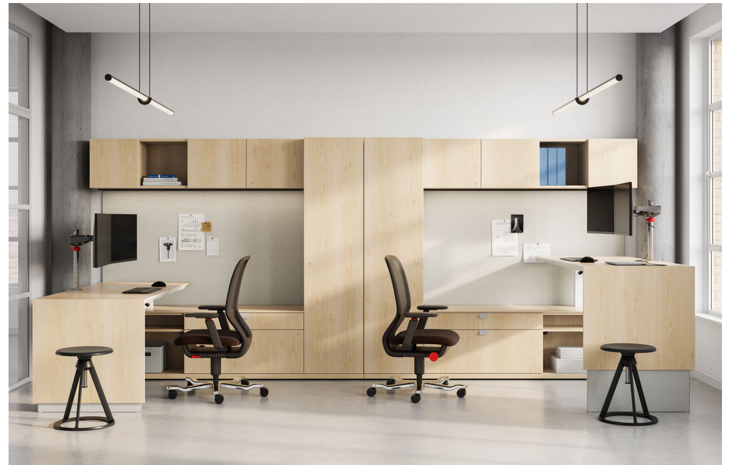
TOP A height-adjustable peninsula with an elegant waterfall surface provides a suitably refined place for individual work or collaborative meetings.